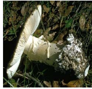
c) Russula sp.