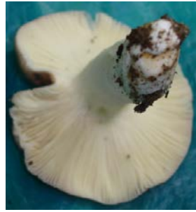
b) Russula sp.