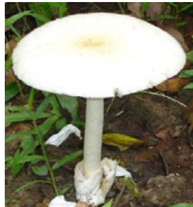
h) Amanita sp.