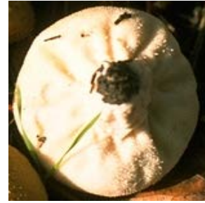
f) Scleroderma verrucosum