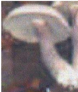
g) Suillus sp.