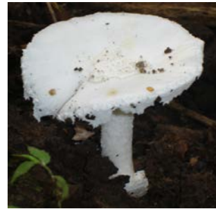
i) Amanita sp.