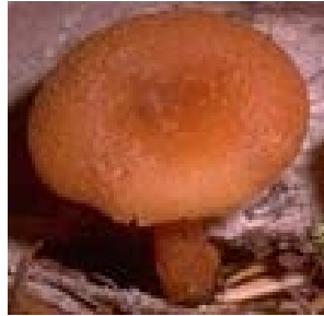
e) Laccaria laccata