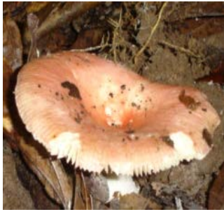
a) Russula sp.