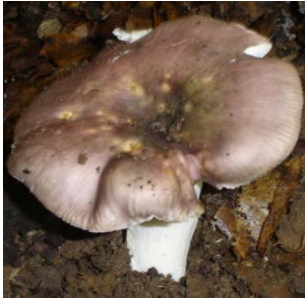
d) Lactarius sp.